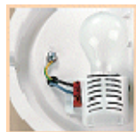
Easily mounted to walls or ceilings