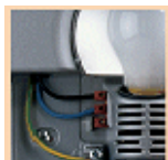
Easily mounted to walls or ceilings