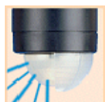
Coverage angle reduction