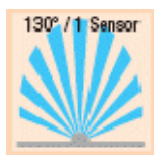
Coverage angle 130°