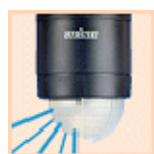
Coverage angle Reduction