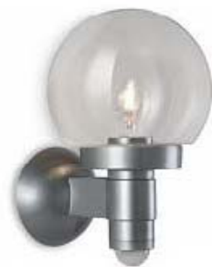
▪ Mundgeblasenes Kristallglas