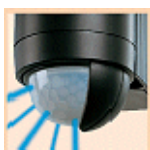
Coverage angle reduction