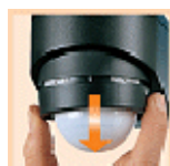
Pull off decorative ring