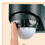
Twilight, time setting