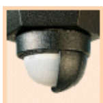
Coverage angle reduction